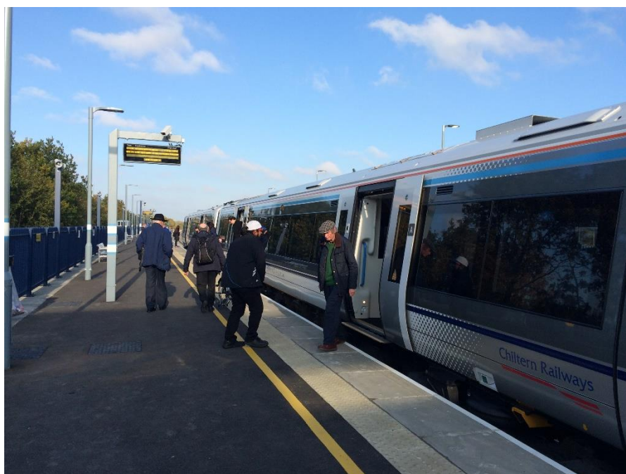
Oxford Parkway on the first day of service.

I travelled to London on 26 th October from the new "Oxford Parkway" (Kidlington) station and saw Otmoor from a different view as we passed through Islip to Bicester.